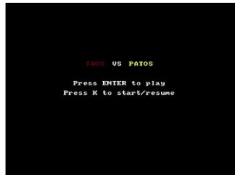
First basic menu

We started by building a simple menu that had no options nor information, that allowed us to play the first and basic version, it just consisted of a Taco that moves according to the player's input and shoots a duck.