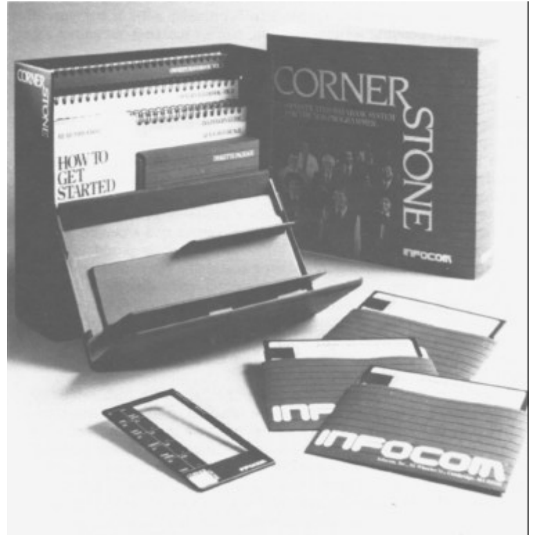
Cornerstone: The sophisticated database system for the non-programmer.