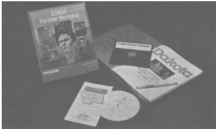
Items from Dr. Perleman's desk are contained in every A Mind Forever Voyaging package.