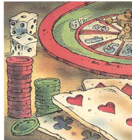
THE BOZBARLAND CASINO: Name your favorite game of chance and we've got it. Roulette, double fanucci, burfle, blackjack and more! You'll have the time of your life and maybe walk out with a million zorkmids!