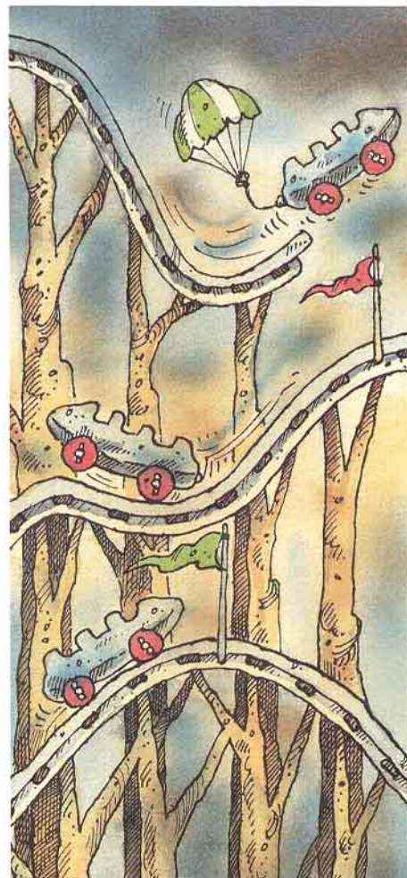
THE ROLLER COASTER: Hold onto your glorbs! You'll travel faster than you've ever travelled before. Magic and engineering combine to create the most thrilling experience imaginable!