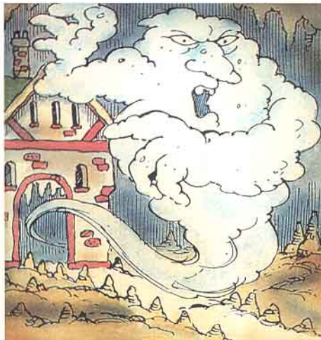
THE HAUNTED HOUSE: The only authentic haunted house you'll ever visit. We've imported ghosts, goblins, spooks, spirits and apparitions from all over the Kingdom. You'll never forget your walk through the Haunted House . . . IF you get out alive!