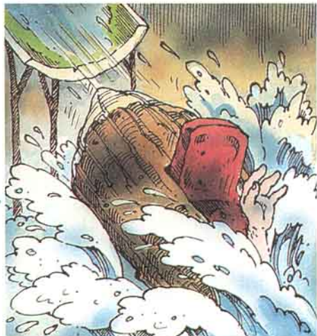
THE FLUME: This splash-filled log boat ride is the largest of its kind anywhere in the world. You'll never trust a water vehicle again!

Bozbarland is just a short trip away, at the western end of the Great Underground Highway. Admission is just one zorkmid, all year round! And be sure to take in Bozbarland's many neighboring sights, the highlight being ancient Egreth Castle, the home of old King Duncanthrax. Make sure your vacation includes a stop at Bozbarland!