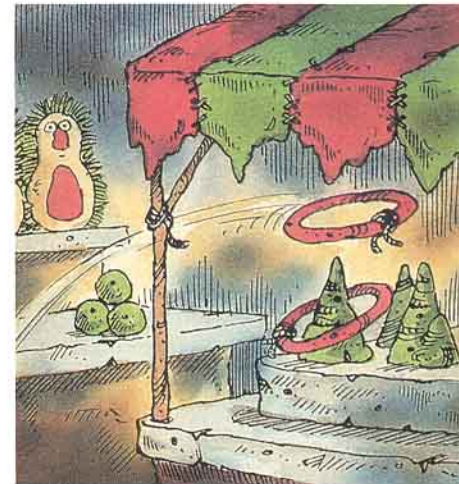
MIDWAY: Where else can you find almost a square bloit filled with games of chance and skill? And refreshment stands that sell cotton candy, dragon burgers and fried glurz?