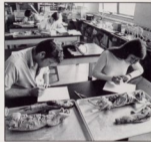
Biology students delve into the mysteries of the digestive system. This popular course makes full use of G.U.E.'s modern laboratory facilities.

Another way to broaden your college life is to take a class entirely unrelated to your distribution requirements or your major. The "Zinc As Life Force" Seminar in the Department of Alchemy is but one of the many unusual courses you'll find in your catalog.