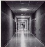
The infinite Corridor connecting the Aeronautics and Chemistry buildings seems to stretch into infinity. It will soon become as familiar to you as your dorm room.

Streamer Day —Take all the toilet paper rolls from the bathrooms and throw them out of the dorm windows.