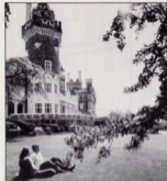
Students relax on the quad in front of Edwards Hall, one of the architectural gems of G.U.E. Tech. The campus spans a century in building design, ranging from the Victorian opulence of Edwards Hall to the reflective glass facade of the Nutrition Building.

Although you'll be spending most of your time studying, it's important to remember that life exists outside of your textbooks and your computer screen. Take an afternoon to visit the Museum of Contemporary Art or the Loeffler Aquarium. Join the Freshman Drama Group or the Hellenic Club. Write a weekly column for the G.U.E. GNEWS. Take advantage of the Athletic Complex, whose weekly paddleball tournaments draw a lively crowd.