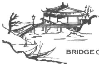
BRIDGE OF DREAMS