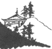
GATE OF DAWN